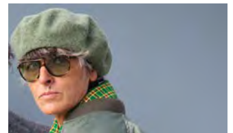
Singular Women — 40-60 year olds