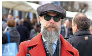
New Normals — 40-50 year olds