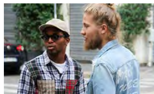
CreActives — 20-25 year olds