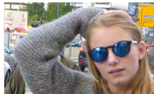
ExpoTeens — 13-15 year olds