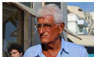
Pleasure Growers — over 70 year olds