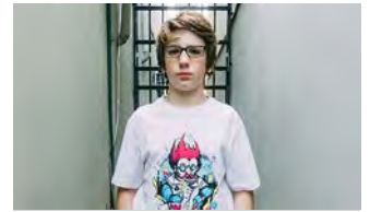
TechTweens — 9-12 year olds