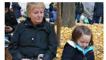
Family Activists — over 65 year olds