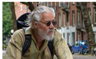
Mind Builders — 50-60 year olds