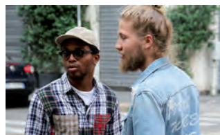
CreActives — 20-25 year olds