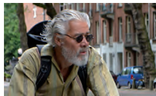
Mind Builders — 50-60 year olds