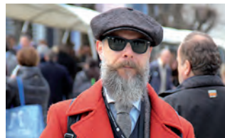
New Normals — 40-50 year olds