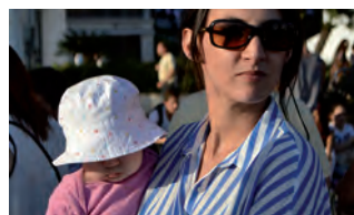
ProFamilies — 30-35 year olds