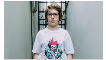
TechTweens — 9-12 year olds