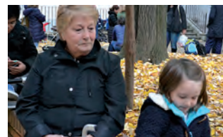
Family Activists — 65-80 year olds