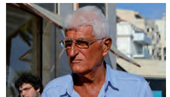
Pleasure Growers — 65-80 year olds