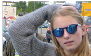
ExpoTeens — 13-15 year olds