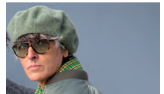
Singular Women — 40-60 year olds