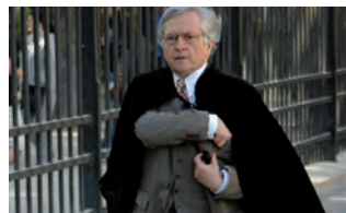
Job Players — 65-75 year olds